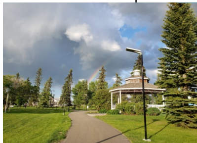
"Centennial" by Cheryl Persson

On September 27, 2021, Council declared the following photographs are the winners of the 2021 "I LOVE Olds" photo contest: