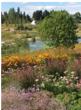
"Wetlands Beauty" by Leona Megli