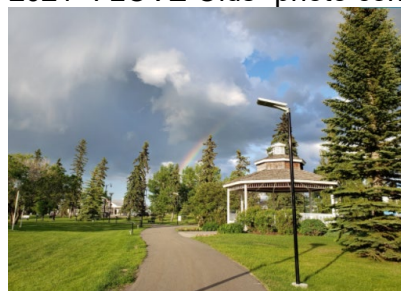
"Centennial" by Cheryl Persson

On September 27, 2021, Council declared the following photographs are the winners of the 2021 "I LOVE Olds" photo contest: